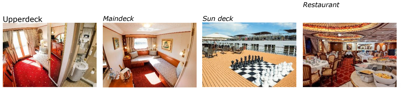
MS PRINZESSIN KATHARINA

Sofabeds and a Pullman-bed (folded up against the wall during the day for more comfort) • the 3-bed Cabins features a fold away wall bunk bed (max. 80kg) • shower and WC • SAT-TV • hair dryer • AC • On-board radio • phone • mini fridge