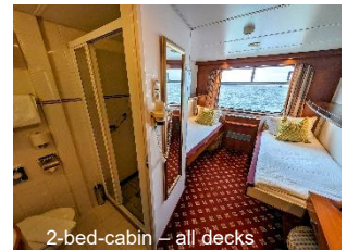
2-bed-cabin – all decks

Cabins: 57 all together, friendly and comfortably furnished with shower/WC, hairdryer, on-board telephone, TV/radio, safe (deposit) and air conditioning. All cabins on both decks have a large panoramic window, of which the upper part can be opened.